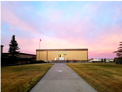
Lomond Community School Box 69 Lomond, AB T0L 1G0 Phone: (403) 792-3620